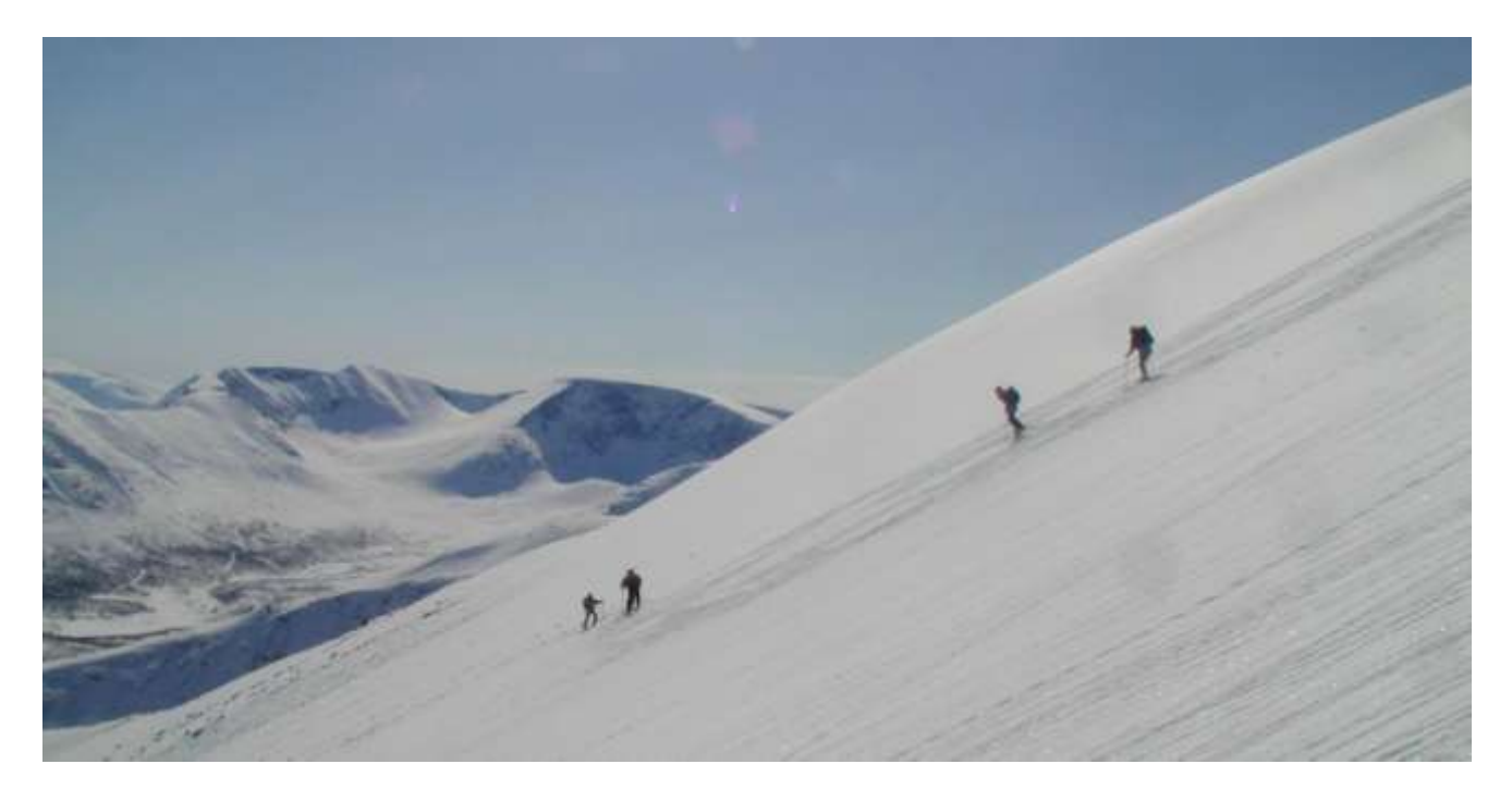
Day 7 Ski ascent/descent mt. Putellichorr 1165m. The best ski-descent. Back to the hut. Night in hut or hotel. Fullboard. BLD