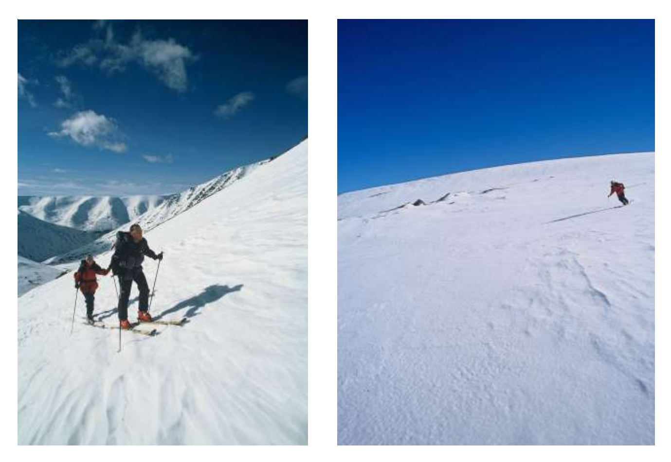
Day 8 Morning ski touring, snowscooters to Kirovsk, bus to Apatity. Train to Saint-Petersburg at 22h45 BLD

Day 9 Day on the board. Arrival to Saint-Petersburg at 22h53. Transfer to the hotel. Night in hotel. BLD